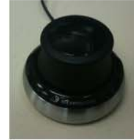
Figure 3: 3D Mouse

The first question asked in the introduction was: What is the most appropriate mapping between the 2D interface surface and the 3D world? We have proposed a simple solution to the problem, through the set of gestures described above. Defining and implementing the most natural mapping between this 2D multi-touch interface and the 3D world may still require additional work, but the concepts advanced in